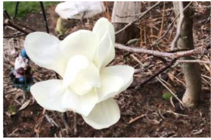
Magnolia in Johanna Cutts' garden